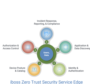
iboss Zero Trust Security Service Edge